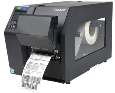
Barcode Verifier (T8000 ODV-2D)