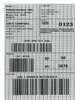
Full Overstrike Example

Software partners such as TEKLYNX already use this application connection to provide a close-loop label quality process.